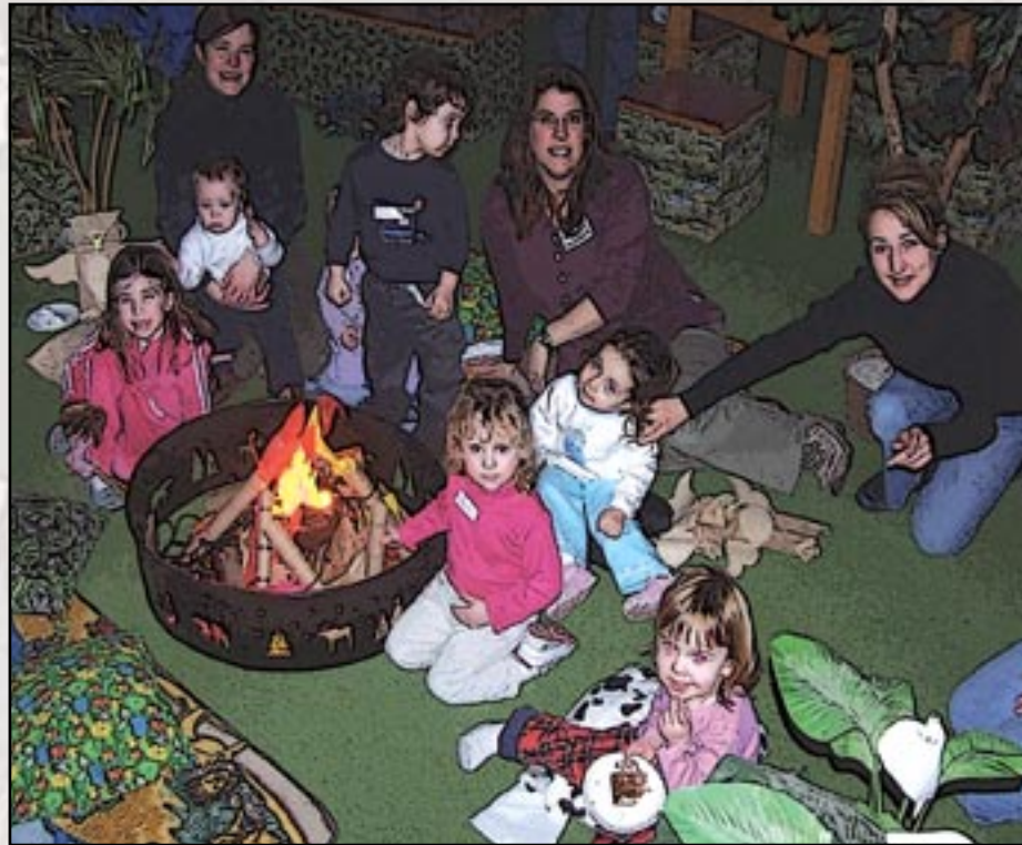
Pretend camping in Cub Club 2006

For 10 days in August, the education department also hosted the Wyland Clean Water National Tour, which featured a giant water conservation maze produced by the Wyland Foundation and Minotaur Mazes. Thousands of visitors traveled through the maze, wrote letters