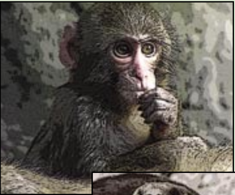
Japanese macaque (born 2006)

Species or specimens of significance acquired in 2006 Lemur tree frog, Pratt's rocket frog, robber frog, Panamanian golden frog, ring-tailed lemur, North American river otter, Amur tiger, snow leopard, giant anteater, hump-headed dragon, Eastern massasauga, Annam leaf turtle