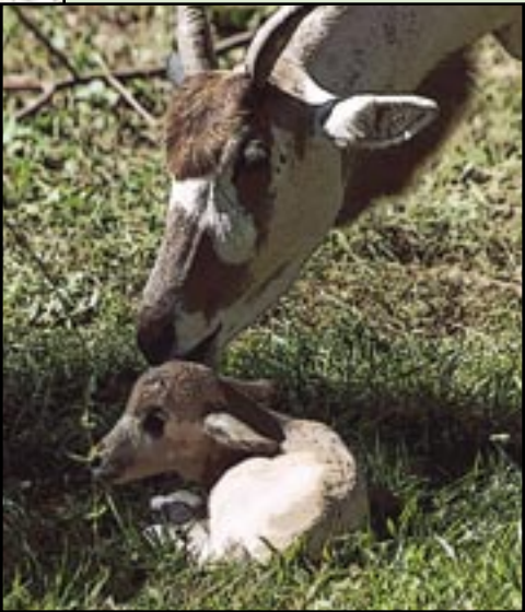
Addax (born 2006)