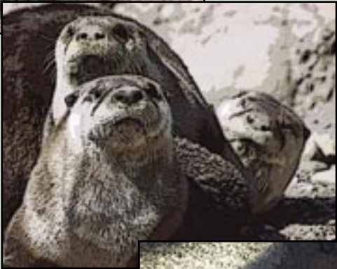
North American river otter (acquired 2006)