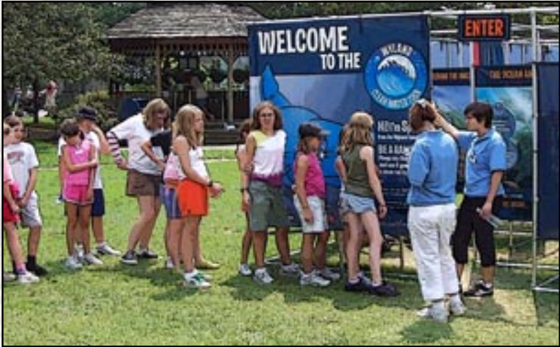
Children of all ages lined up for Wyland’s Watershed Maze that was here for the Wonders of Water celebration.

The Buffalo Zoo’s 10th annual Howl-O-Ween Hayrides were scheduled for October 20, 21, 27 and 28. However, the event was canceled the first weekend due to large amounts of debris left from the snowstorm. After staff from every department worked hard to clear branches from pathways, Zoo grounds were declared to be safe for visitors to enjoy the event the following weekend. Sponsored by Tops Markets, this friendly, not frightful event featured treat stations, hayrides, games, apple cider and donuts.