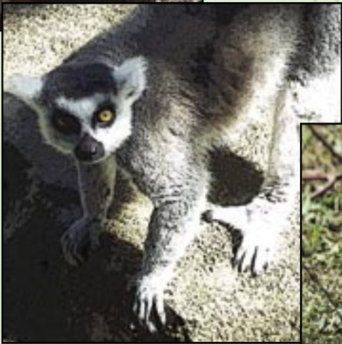
Ring-tailed lemur (acquired 2006)