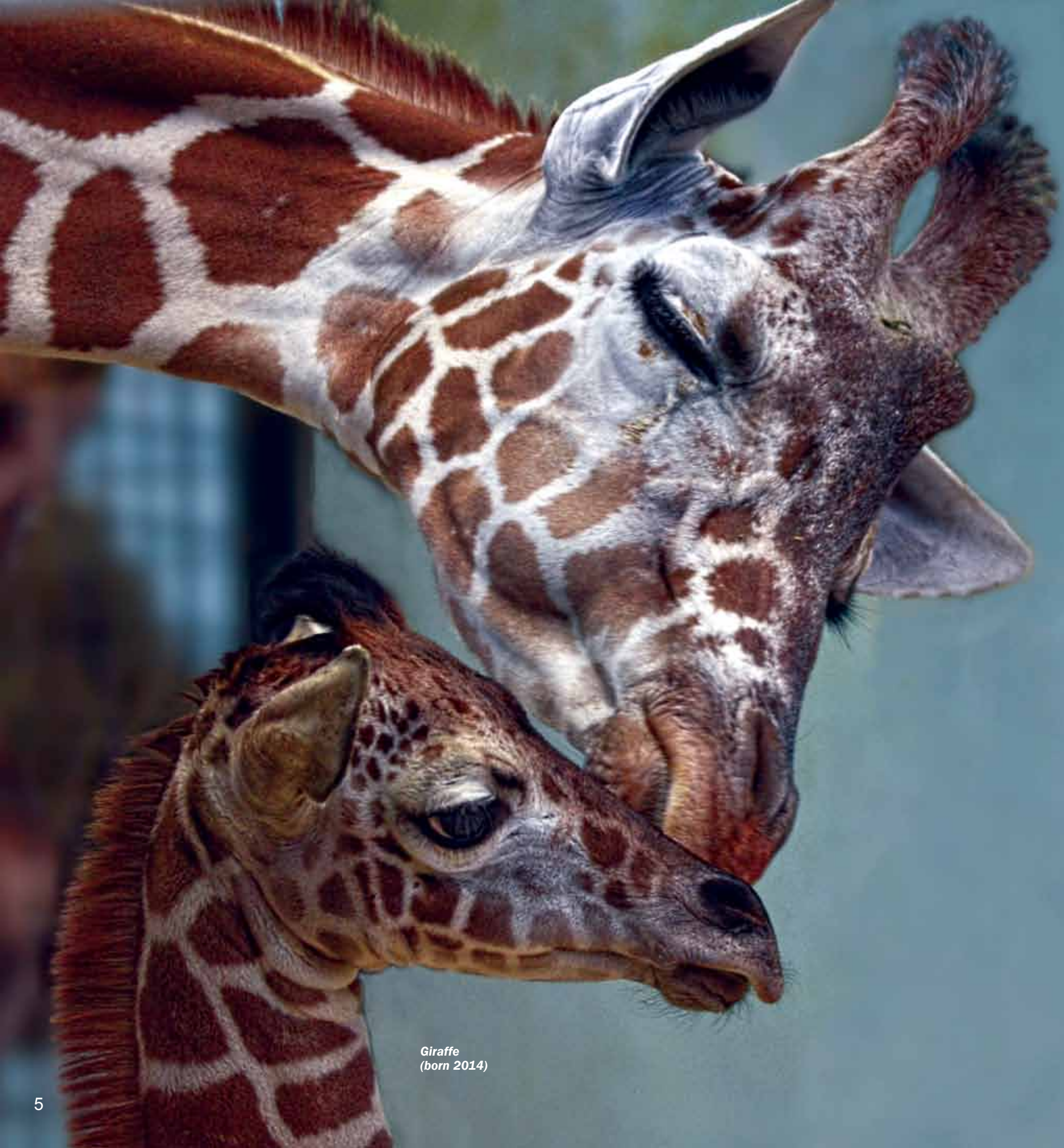
Giraffe (born 2014)