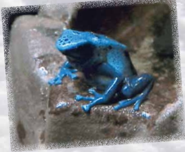
Blue poison dart frog (born 2011)