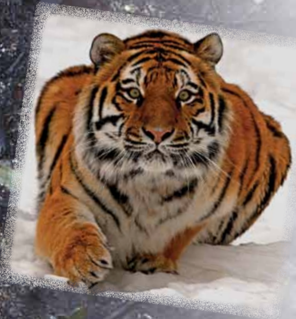
Amur tiger (acquired 2011)

Domestic zebu, Ossabaw Island pig, cotton-top tamarin, raven, red lory, monkey-tailed anole, desert iguana, hump-headed dragon, lemur tree frog