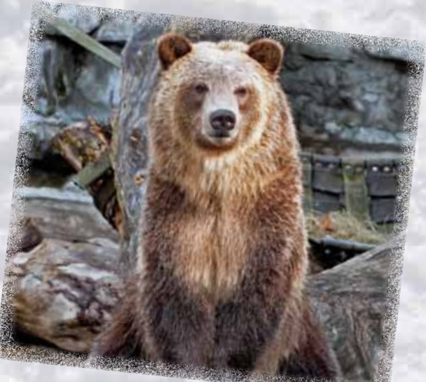
Grizzly bear (acquired 2011)