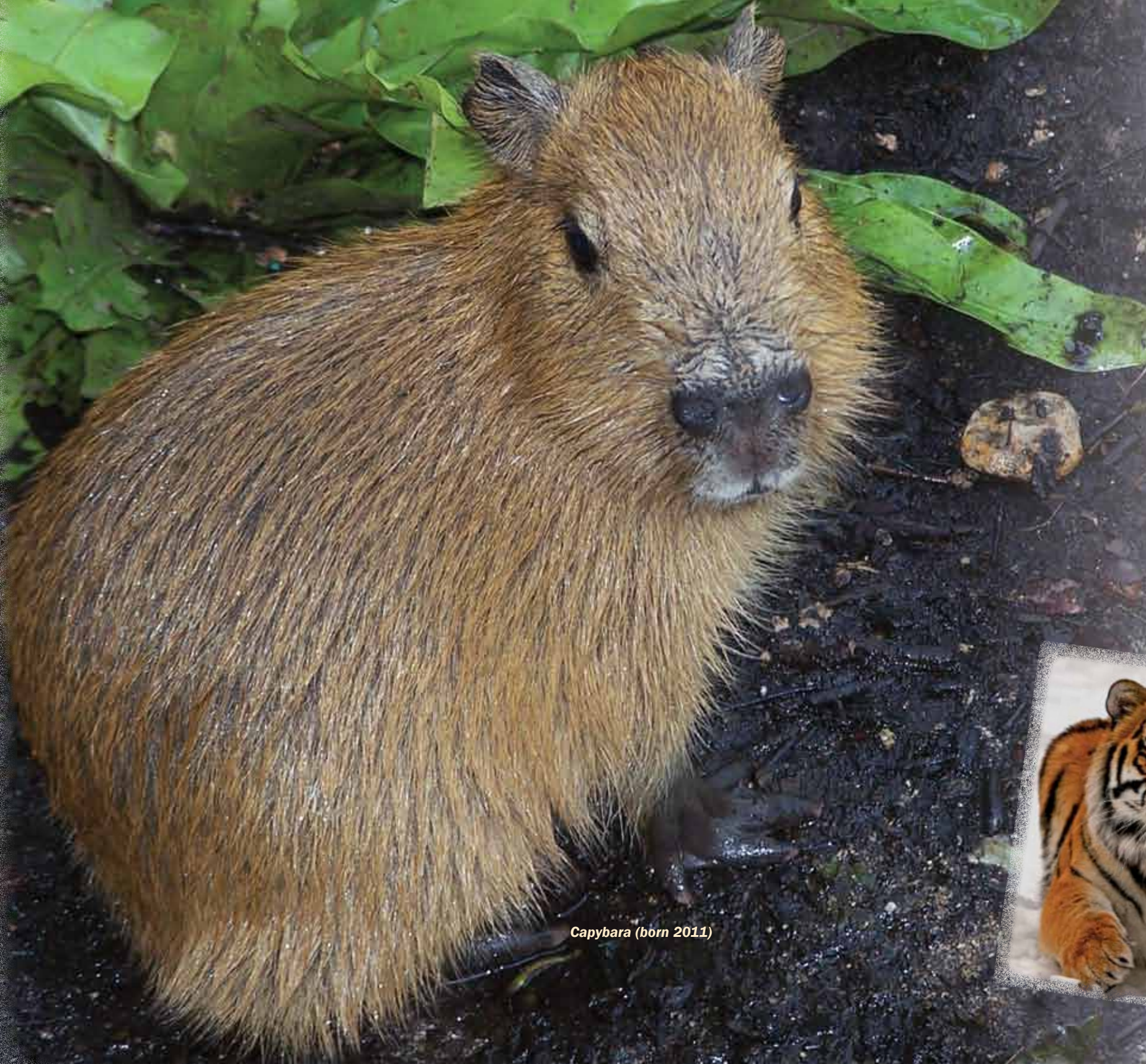
Capybara (born 2011)