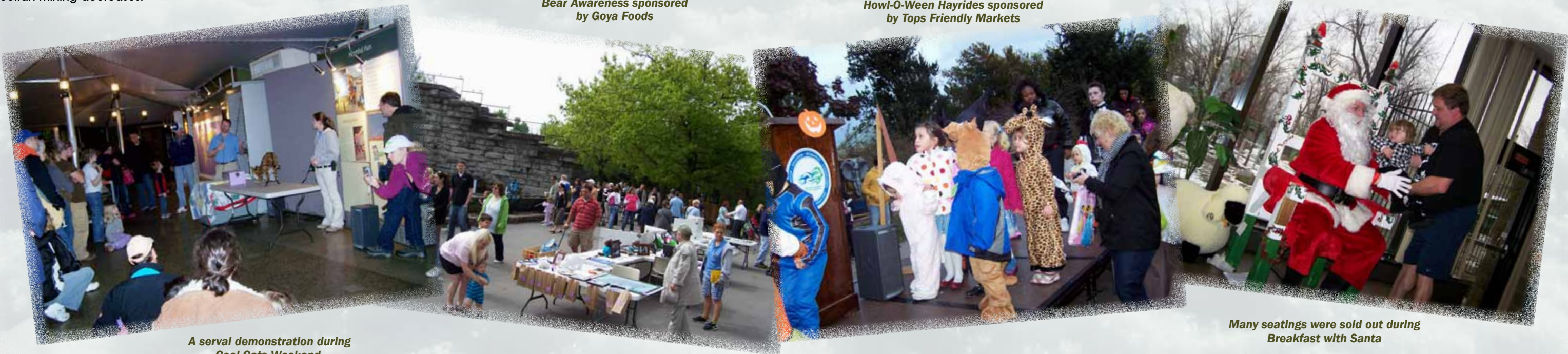
A serval demonstration during Cool Cats Weekend.