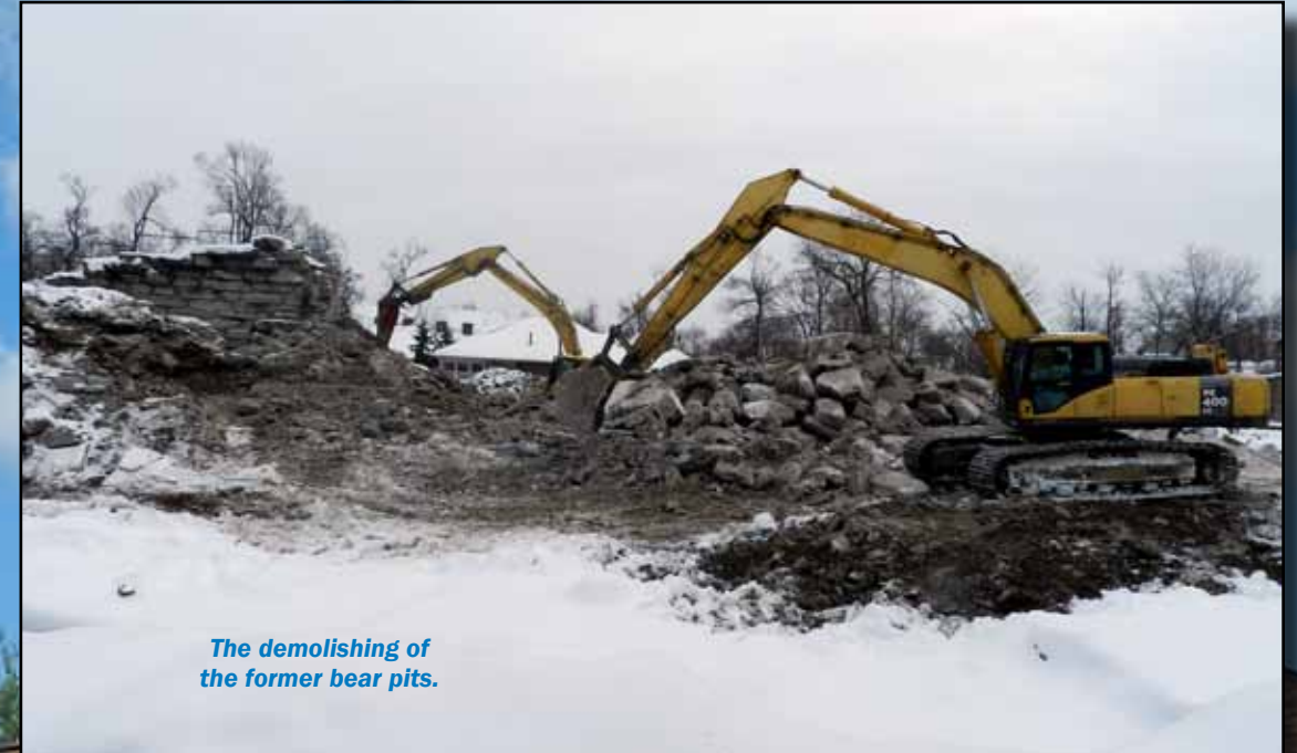
The demolishing of the former bear pits.

After successfully completing the fundraising campaign, the Buffalo Zoo demolished the former bear pits in November of 2013. It was the first step towards construction of the Arctic Edge exhibit, which is slated to open in 2015.