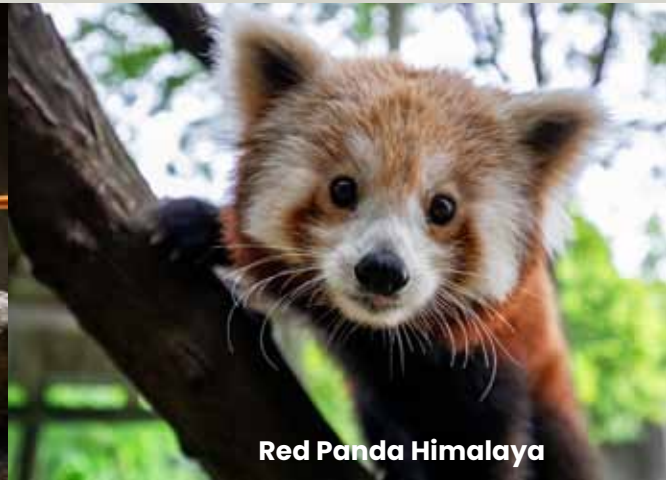
Red Panda Himalaya