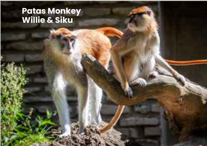
Patas Monkey Willie & Siku