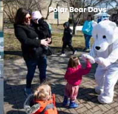
Polar Bear Days