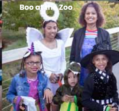
Boo at the Zoo