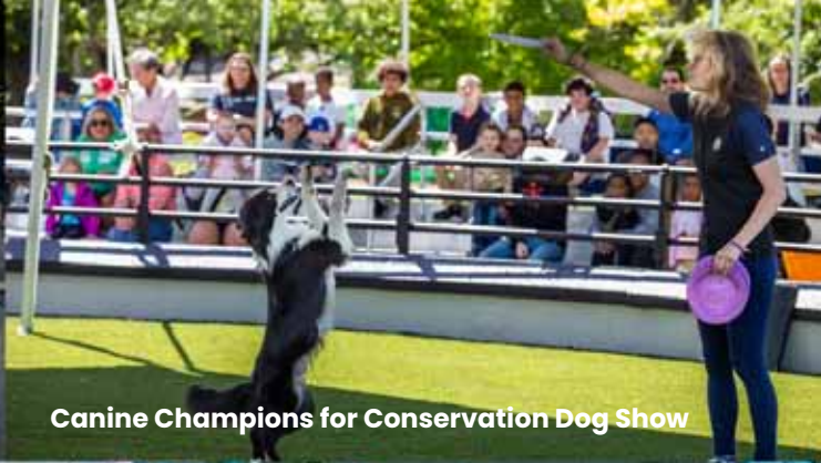
Canine Champions for Conservation Dog Show