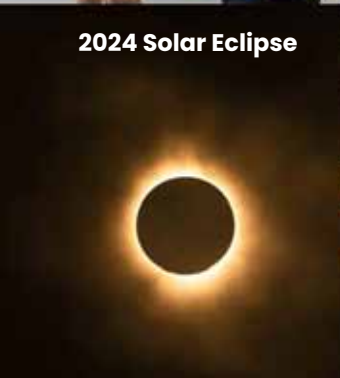
2024 Solar Eclipse