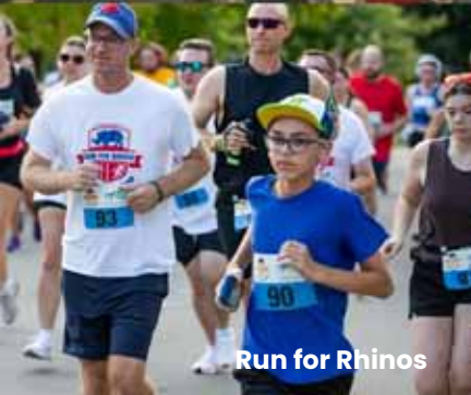
Run for Rhinos